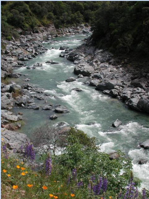
River at Buttermilk Bend Trail