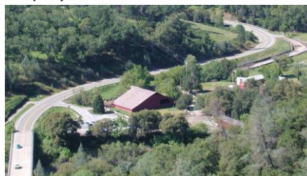
Bridgeport from Independence Loop Hill

This year will be an especially busy and exciting year at the Park. Some of the major activities include the start of construction of the gas station project, preparing for the California Preservation Foundation Conference, completing the Trees and Shrubs trail guide, staging the Spring Festival, raising funds through business sponsorships, and providing more assistance to the State Park employees.