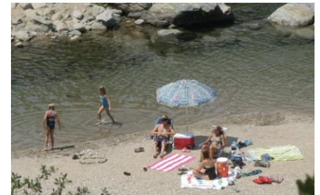
Spring is here, summer is soon

Conservation Trust Fund Act of 2010". Instead of facing an uncertain budget each year, the parks would be funded through trust fund revenues. The revenues would come from an $18 annual State Park