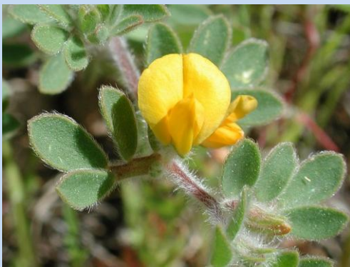
Hill Lotus close-up