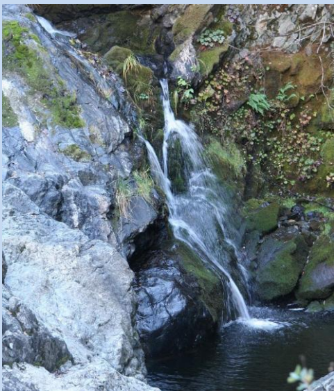
Mini waterfall near river-crossing flume on Independence Trail